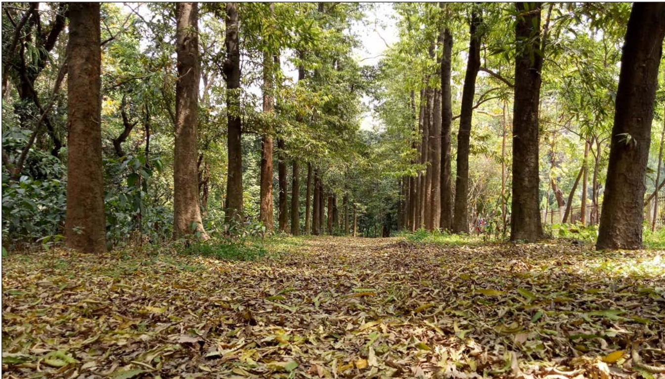
Bhawal National Park