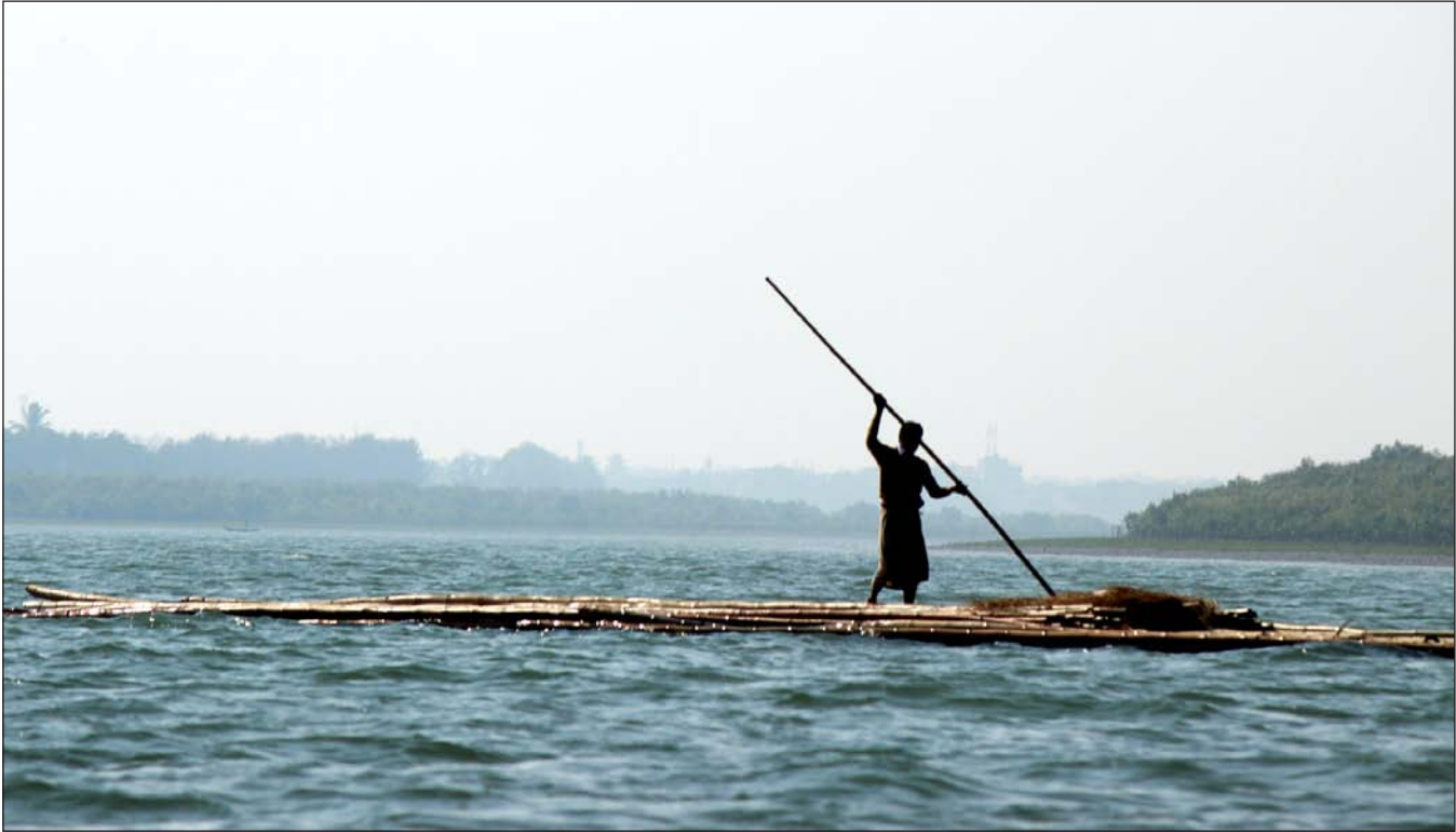
Char Kukri Mukri, Bhola