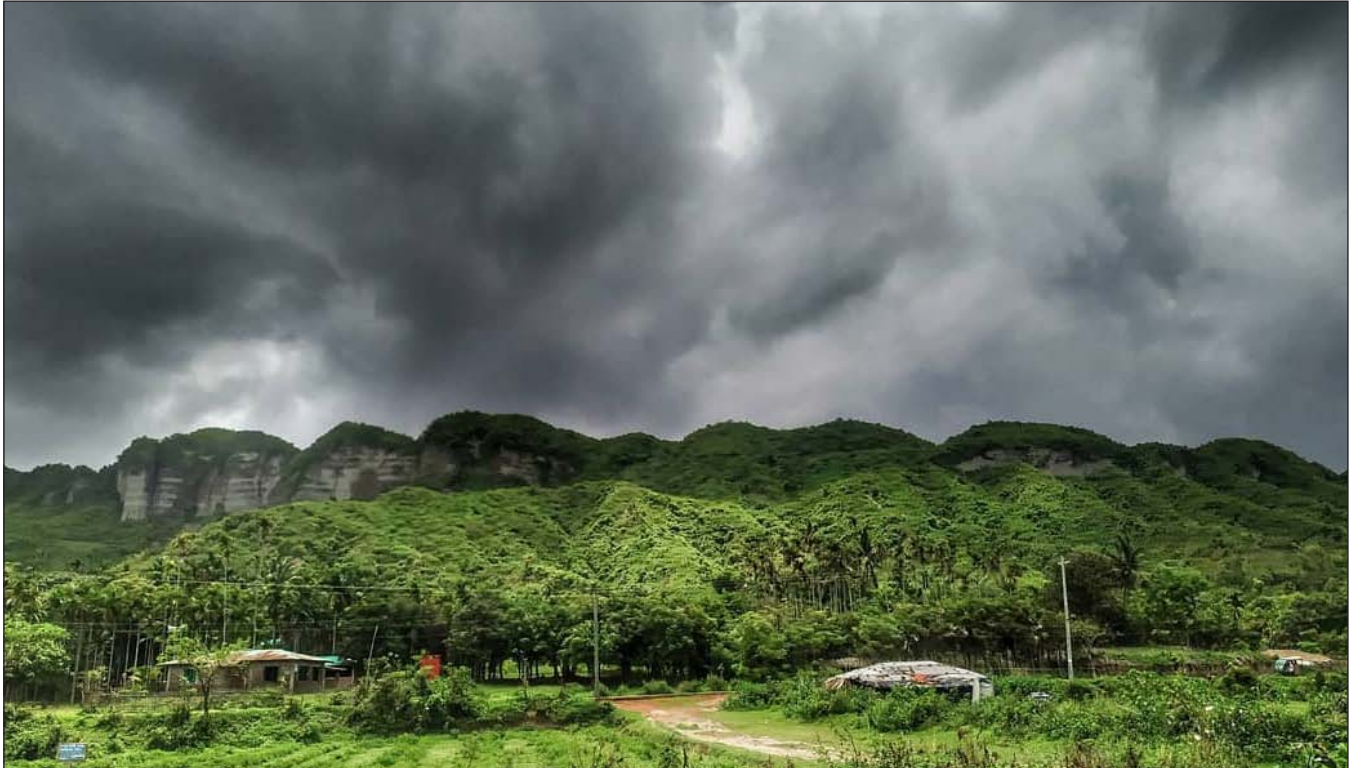
Cox's Bazar, Marine Drive