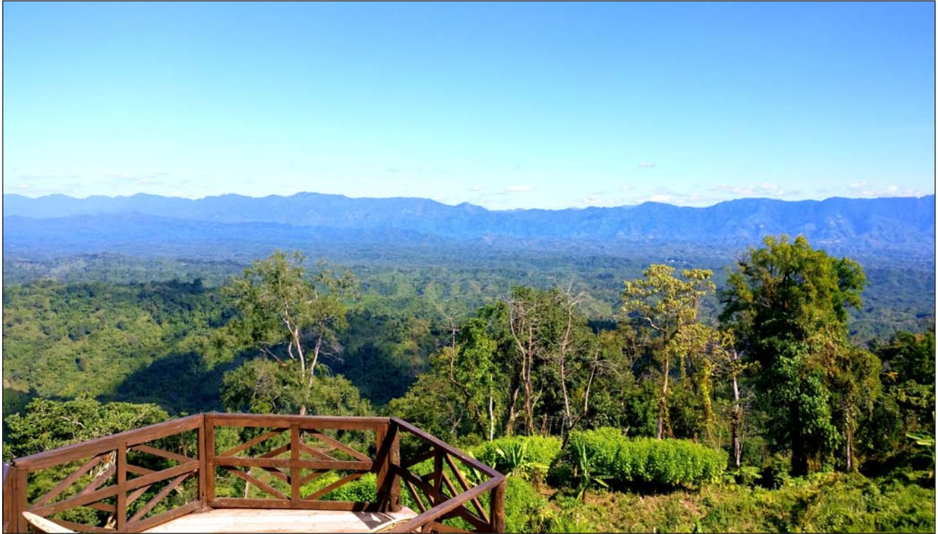
Sajek Vallley, Rangamati