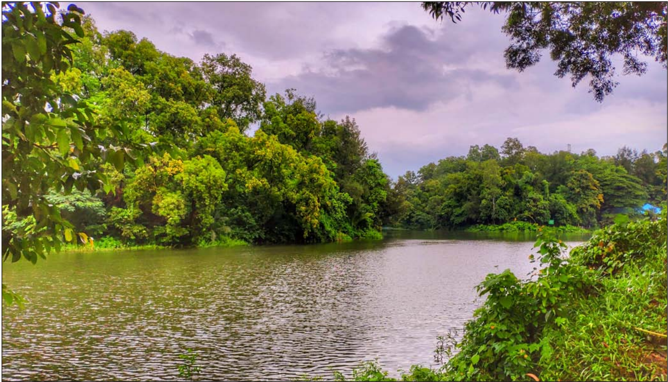
Foy's Lake, Chittagong